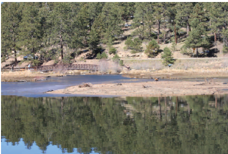
Sediment delta formation in Evergreen Lake caused by the flooding event in September 2013.