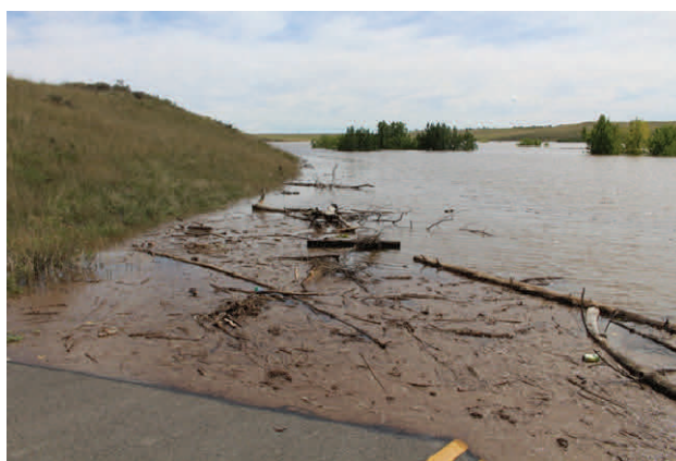
Bear Creek Reservoir Chemistry Comparison

received about 20,650 ac-ft of runoff. The peak flood chemistry showed a Total Phosphorus load in excess of 1,650 pounds, a Total Nitrogen load of 22,550 pounds and the Suspended Sediment load was about 900 tons (750 cubic-yards) with an estimated bedload of about 13,500 tons (11,200 cubic-yards). It is very likely that Evergreen Lake will need dredging to reduce this massive sediment load. The Association monitored watershed nutrients beginning near Mt. Evans following the flood event. From a water quality perspective, the watershed showed remarkable resilience. Although Bear Creek Reservoir returned to normal pool by the end of October, the water quality in the reservoir may be altered for years to come. This storm event has provided valuable insight into big-event nutrient loading. The Bear Creek Watershed Association is applying an adaptive management process to adjust monitoring, strategies and options, and redefine restoration projects throughout the watershed.