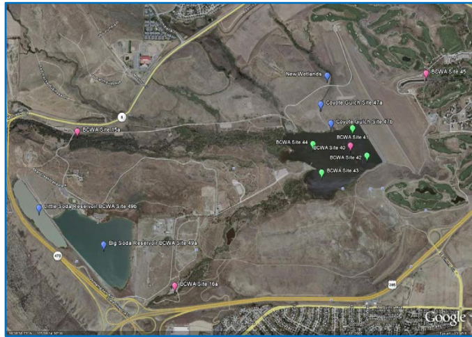
Figure 3 Bear Creek Park with BCWA Sampling Sites

The P1 monitoring program is contained in a spreadsheet titled MSD2018 P1-P4 Master Spreadsheet . The spreadsheet contains all data and analyses. Copies of the spreadsheet are distributed to Association membership, WQCD staff and interested parties in March/April 2019 after approval from the Association Board (Bear Creek Association March 2019). The Bear Creek Reservoir data and analyses are summarized in the annual report to the Water Quality Control Commission. Table 2 summarizes the Bear Creek Reservoir monitoring data.